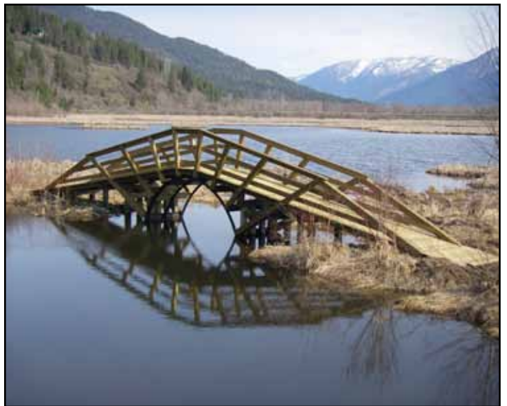
New bridge connection to the Wildlife Centre

A number of years ago, busy beavers dismantled their namesake trail, Beaver Boulevard. Keen to block up the canoe route, the beavers gathered mud from the creek banks on either side of the Beaver Boulevard footbridge. This excavation work uncut the footbridge footings, toppling the bridge. For many years, this fun, winding toe trail has been unused, waiting for a new connecting bridge to be built. This spring we are celebrating the installation of two new foot bridges, bringing Beaver Boulevard back into the Marsh Trail Loop system. This trail is an important section of the loop, creating a safe walking route back to the Wildlife Centre, keeping students and public off of West Creston Rd. Volunteers will be actively grooming and preparing the trail for opening in mid May.