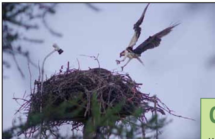
Osprey coming in for a landing with a fish in its talons.